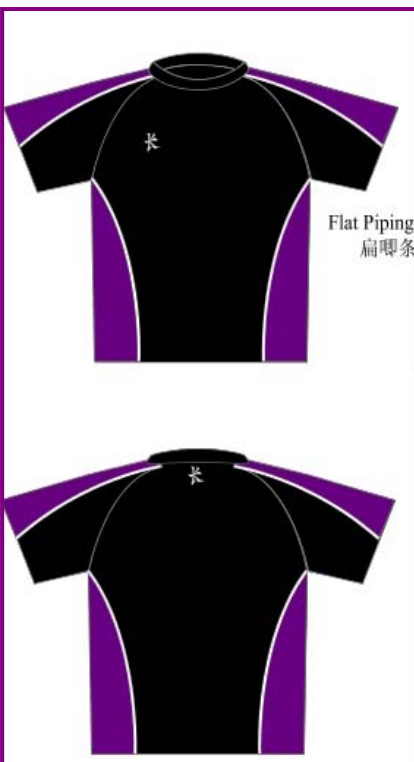
Flat Piping 扁唧条

The club are putting together another order of hoodies and t-shirts during the forthcoming summer series and the pictures here show the designs, if you've not already seen them in action!