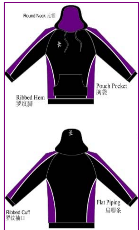
Round Neck 元领