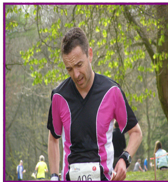
The editor feeling the pain on the run-in of the Men's B final

where trying to pick out the optimum routes, whilst running at speed through the snickets and alleyways, was a great test. Then something happened, which has not affected me before at an orienteering event. Prior to the